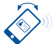
Twist & Go